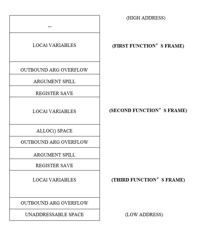
Figure 2.2: Stack Frame Layouts